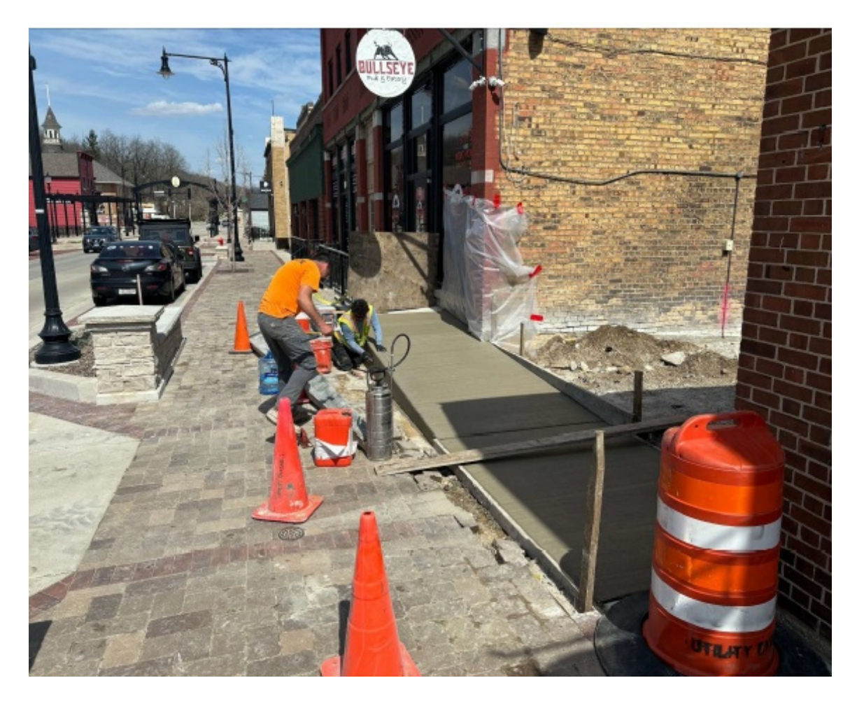
Finishing the new ADA ramp at Bullseye Pub

The contractor will also remove the existing storm sewer and install new storm sewer on the north side of West Washington Street.