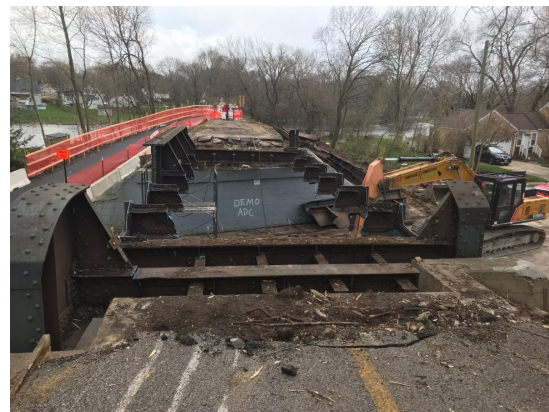
Demolition of the bridge over La Fox River Drive