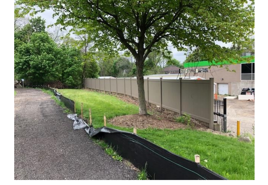
New fencing installation

We have received several questions about the type of lighting that will be installed along the trail. Please note: