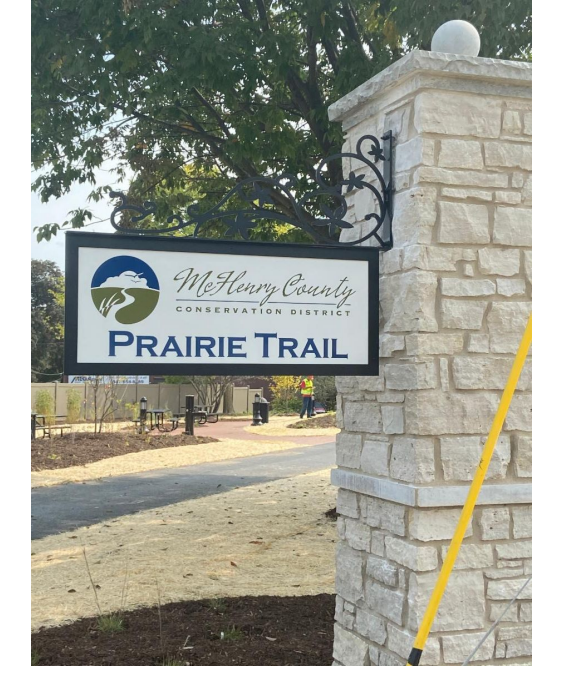
New Trail sign

Thank you for your patience and cooperation as we wrap up construction!