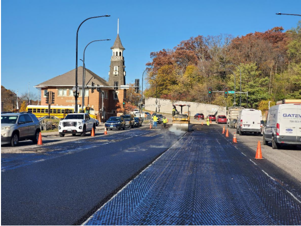
Paving Algonquin Road