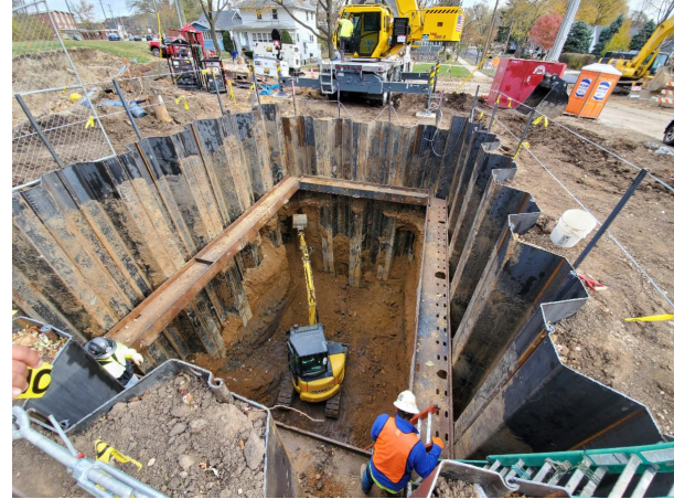
Excavating the lift station

This week, the contractor made the following progress: