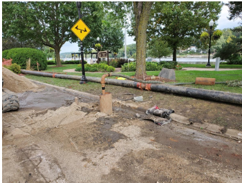
Photos of similar dewatering well installation

This week, crews started the process of installing the de-watering wells along La Fox River Drive south of the Prairie Trail pedestrian bridge. These temporary wells will lower the ground water elevation and keep trenches dry, allowing the utility work to occur. On Sunday, residents will see the contractor on site to refuel the generators needed for the wells.