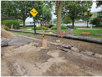
Photos of similar dewatering well installation

This week, the contractor has begun installing a series of temporary wells that will lower the ground water elevation and keep trenches dry, allowing the utility work to occur. Installation of the wells should take approximately two weeks to complete. The contractor also removed trees and brush along Center Street this week.