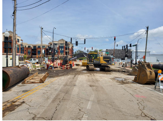
Boring preparatory work