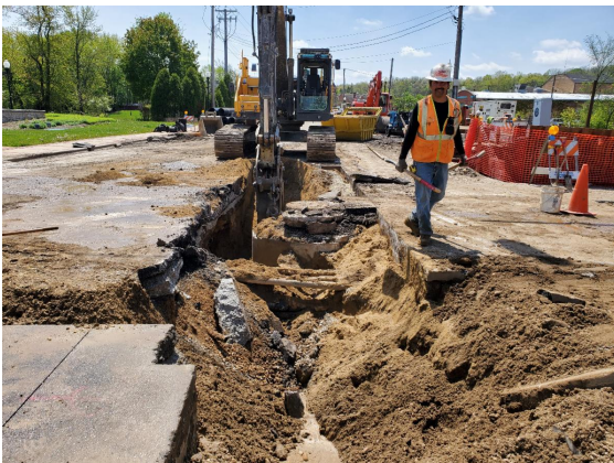
Existing utility locating for water main installation

Starting Monday, May 18, crews will begin boring a 48" steel casing under Algonquin Road, approximately 20' below the roadway. Crews anticipate needing a few weeks to install this casing pipe. Once the casing pipe work is complete, they will install the sanitary sewer within the casing pipe.