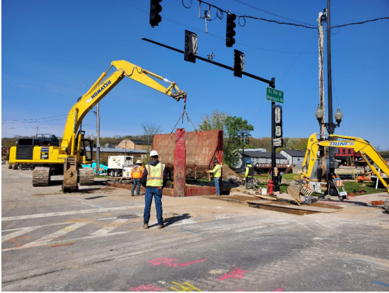
Boring pit shoring installation