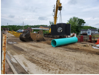
Sanitary manhole installation