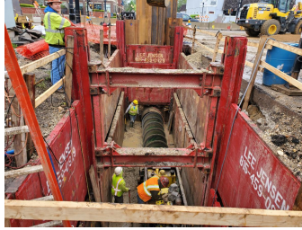
Sewer jack and bore