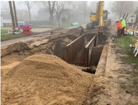
Sanitary sewer excavation

This week, the contractor will begin boring or drilling underground a casing pipe along Harrison Street under Algonquin Road. This casing pipe will allow the sanitary sewer to pass under the intersection of Algonquin Road. Also next week, the water main installation will begin at the intersection of South Harrison Street and Algonquin Road. This work will occur within the IDOT work zone. Both the water main and sanitary sewer installation at this intersection are expected to take a couple of weeks.