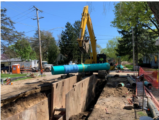
Sanitary sewer being lowered