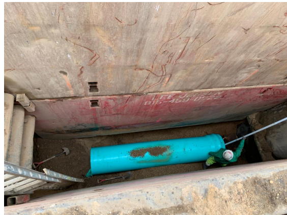
Sanitary sewer installation