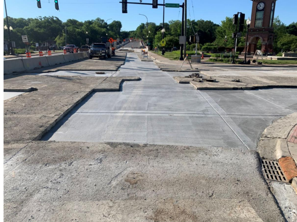
Sanitary sewer installation, road patching and concrete base course placement

Last week, crews completed the pavement patching associated with the work at the intersection of Algonquin Road and Harrison Street and the intersection will be reopened to traffic on Monday, June 15. Additionally, the team resumed construction of the sanitary sewer along La Fox River Drive, they installed the manhole at the intersection of Division Street and La Fox River Drive and have continued to progress north.