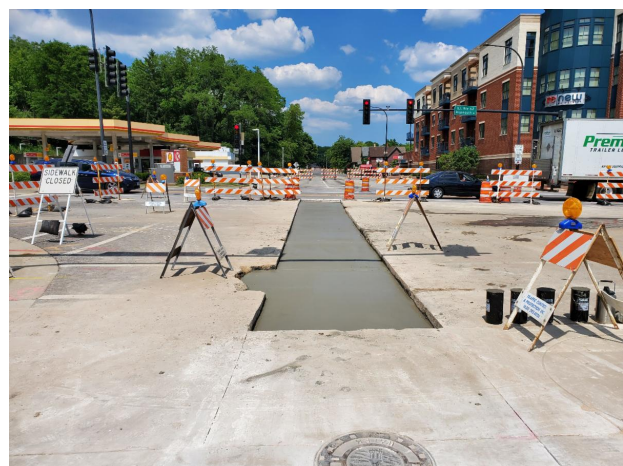
Water main installation and concrete base placement