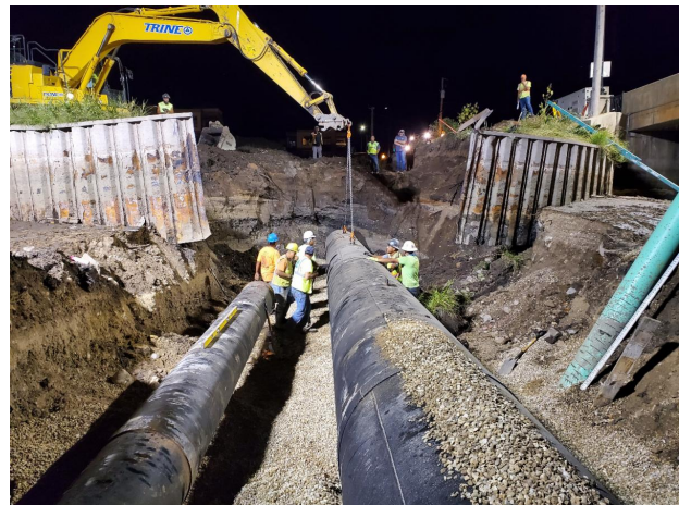
Crystal Creek dam pipes