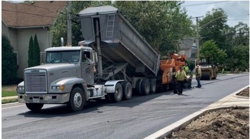
Crews placing asphalt along South Harrison Street

Next week, work is tentatively scheduled to place topsoil and begin seeding.