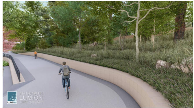
Illustrations of North Main Street roundabout and Harrison Street bike path.