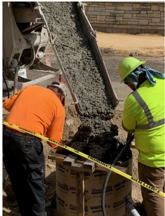
Pouring concrete for light pole foundation