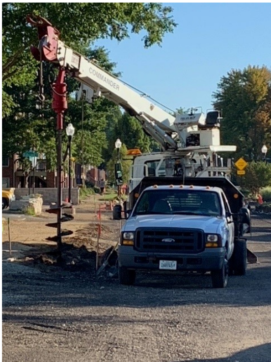
Light pole foundation installation

In the coming weeks, the contractor will be starting water main replacement on the east end of the project near the Village of Algonquin Cemetery.