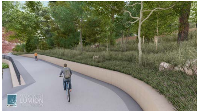
Illustrations of North Main Street roundabout and Harrison Street bike path.