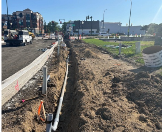
Electrical conduit installation