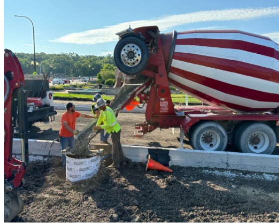
Placing concrete for light poles

As a reminder, the detour shown below is in effect until further notice.